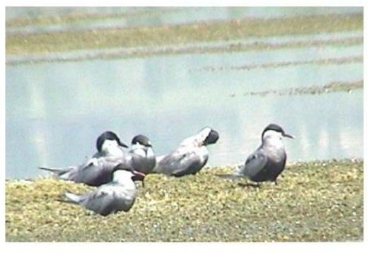
Figure 2: A group of Indian whiskered tern