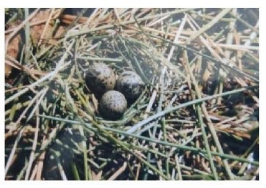
Figure 3: Nest of whiskered tern with egg