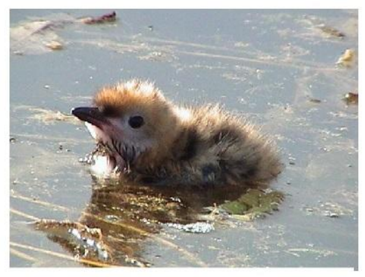
Figure 4: A young one of whiskered tern

Behaviour of Marine Animals.Vol.4, Marine Birds. New York : Plenum Press..